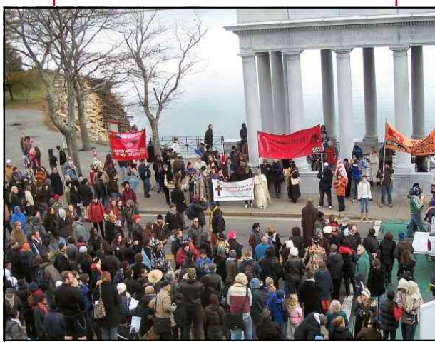
Day of Mourning, 2008, Plymouth, Mass.

These are the words you will find on the United American Indians of New England website ( www.uaine.org ). Each year, members and supporters of Lakota Kidz participate in (and cook at) the Day of Mourning. While most Americans celebrate Thanksgiving, this is the day Native Americans remember those who gave their lives in the struggle against oppression. It is also an affirmation